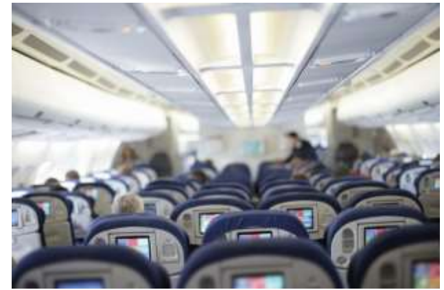
a long flight