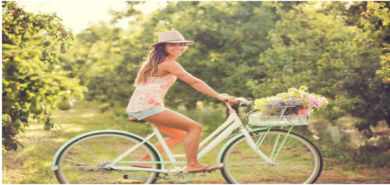
sister/farm/ride her bike

Ask and answer questions about the pictures below.