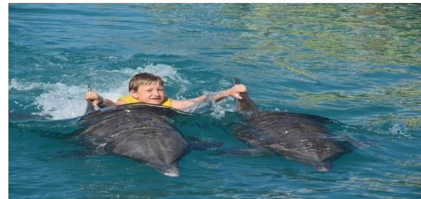
cousin/beach/swim with dolphins