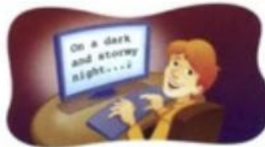
5. a writer