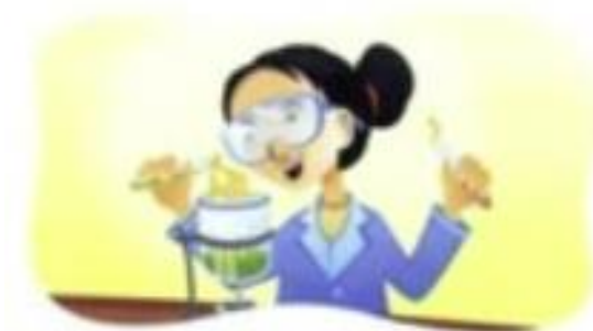
6. a dentist