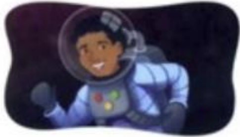
1. an astronaut

Example: What do you want to be? I want to be an astronaut.