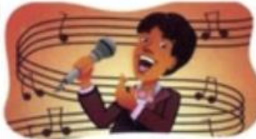
2. a singer