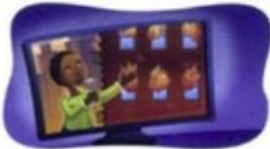
4. a news reporter