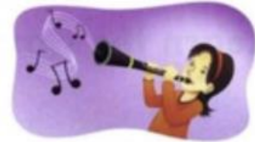
3. a musician