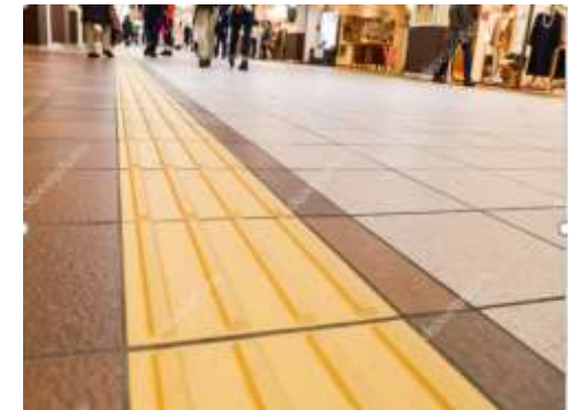
Footpath With Tactile Paving