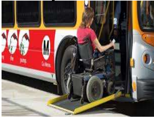
Building Wheelchair Ramp

Types of Mobility Assistance for people with disability.