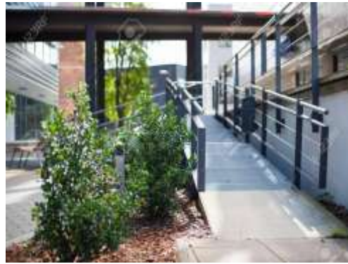
Bus Wheelchair Ramp