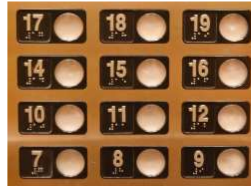
Embossed Braille On Elevator