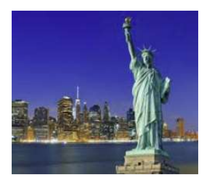
Statue of Liberty