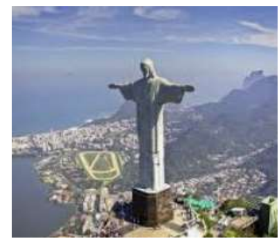
Christ the Redeemer