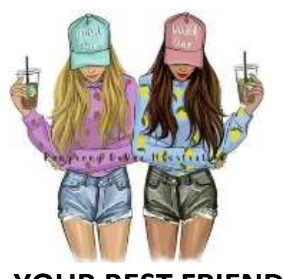
YOUR BEST FRIEND