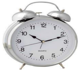
1. Alarm Clock