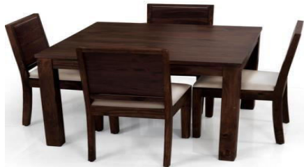
12. Dining table