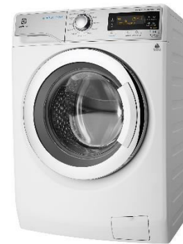
7. Washing Machine