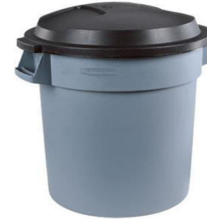
19. Garbage can