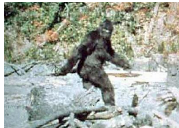
8. The Unexplained Mystery of Bigfoot