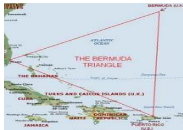
10. The Unexplained Mystery of The Bermuda Triangle