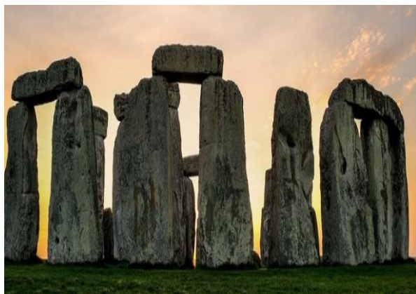
7. The Unexplained Mystery of Stonehenge