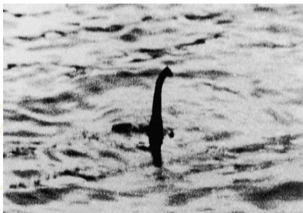
9. The Unexplained Mystery of The Loch Ness Monster