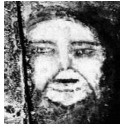
5. The Unexplained Mystery of The Belmez Faces