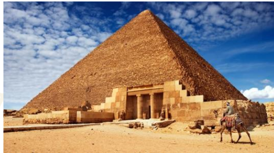
4. The Unexplained Mystery of Pyramid Power