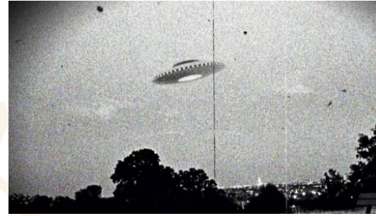
2. The Unexplained Mystery of UFOs