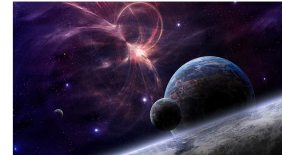
6. The Unexplained Mystery of The Mayan Prophecy

Source: http://www.world-of-lucid-dreaming.com/unexplained-mysteries.html