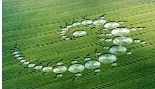
1. The Unexplained Mystery of Crop Circles