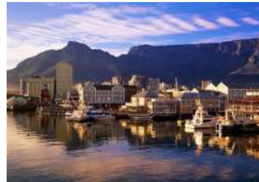
Cape Town, South Africa