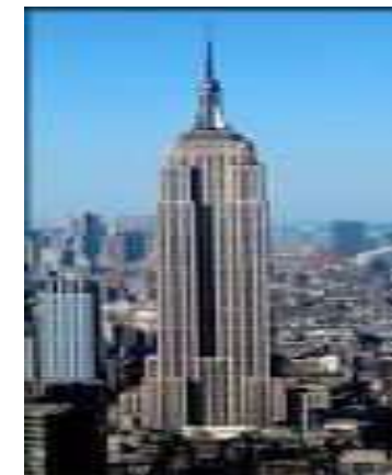
Empire State Building