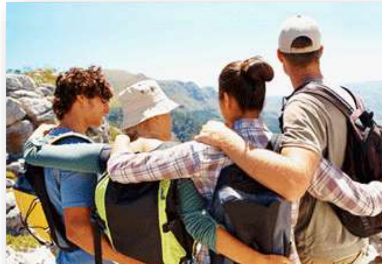
Traveling in groups