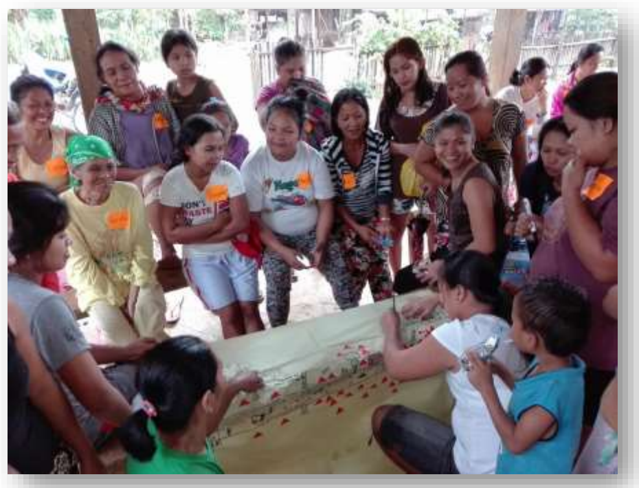
Differentiate the two photos.