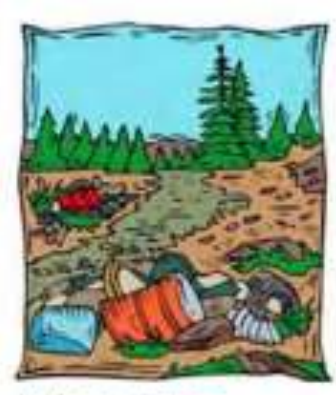
There is too much