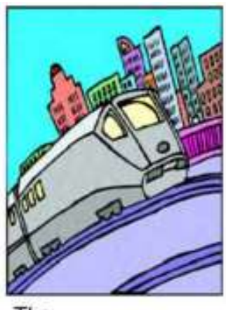
Ine ____ Is very good.