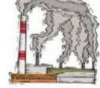
There is a lot of _____ pollution from the factories.