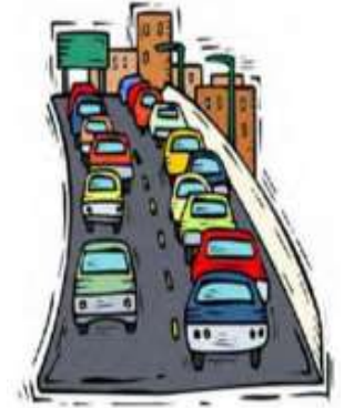
The roads are always