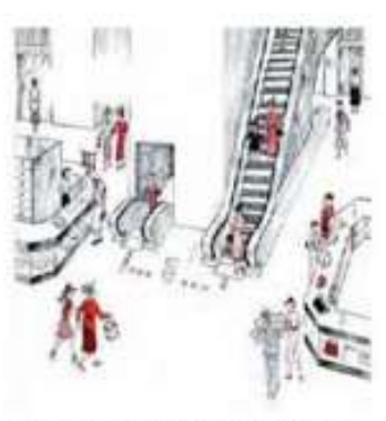
The department stores are so