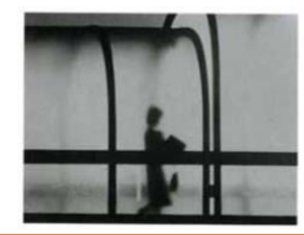
Possible prepositions used

on next to in front of through behind along between