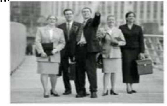
The man is pointing at something. The man is painting something.

If you hear a word that sounds similar to a word you can see or imagine in the picture, it may be a distractor.